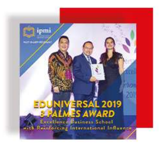
Ranked #1 in 3 Palmes Of Excellence - Excellent Business School With Reinforcing International Influence